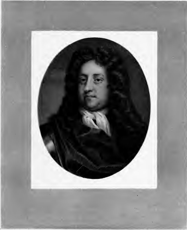
GEORGE, PRINCE OF DENMARK BY CHRISTIAN RICHTER